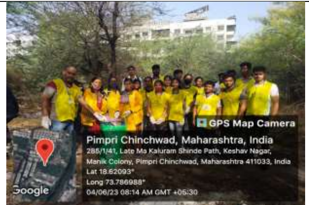
Plastic waste collection drive